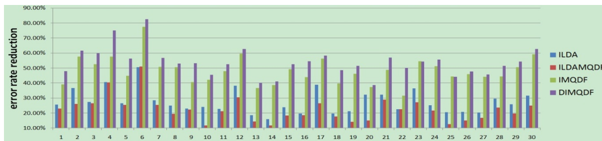
Figure 4 Performance of different writer adaptation approaches for each particular writer

IncCouchDB dataset. For each particular writer’s handwritten samples from the IncCouchDB dataset, we randomly selected 50% of each category’s data for adaptive learning the IMQDF model and then using the remaining 50% to test the writer adaptation performance. It is worth noting that the two datasets don’t share any common writers.